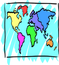
Map & globe